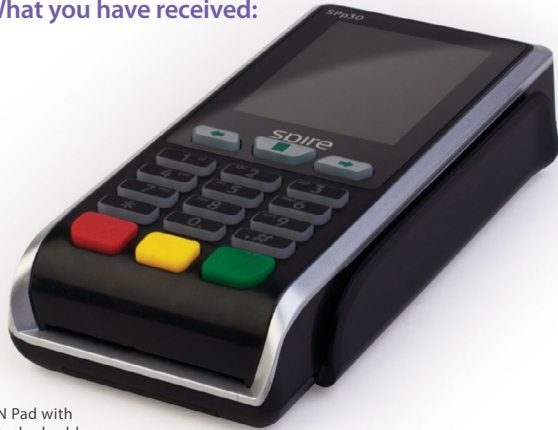
PIN Pad with attached cable

© 2016 Spire Payments Holdings S.a.r.l. All rights reserved. All information is subject to change without notice and Spire Payments does not warrant the information's accuracy or correctness.